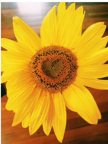
Inflorescent Heart by Agatha Kwon, BSc (Hon), GradDipCardiacUltrasound

On display at the ASEF Booth in the Seattle Convention Center was our beautiful Hearts All Around Us photo exhibit. We also had a collection of images from prior years' exhibits, and all were available to take home with a donation in the name of the photographer. The photo exhibit earned the Foundation $600 in donations thanks to a few photograph admirers. Four of the photos from this year's collection, plus two from previous years have found new homes.