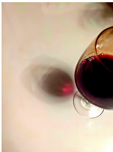
Proof by Brittany Byrd