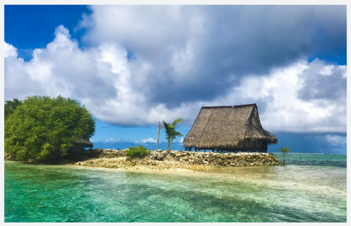
"A Room With A View" by Jill Inafuku

W e all know that ASE members excel at taking images of the heart, but they also snap great images from the heart. At ASE 2019, ASEF will present a curated exhibition of photos taken by ASE members while they travelled the world participating in various medically-related outreach events. Displayed near the ASEF booth will be 19 photographs ranging from faces of people met along the way to landscapes and cultural observations. The selected images will be accompanied by descriptions about the heartfelt memories and what the photos meant to the photographer. Stop by the ASEF booth to experience these awe-inspiring images and read their stories. Want to take one home? Many will be available to take home with a donation to the ASE Foundation in the photographer's name. Photos from prior years' exhibits will also be available.