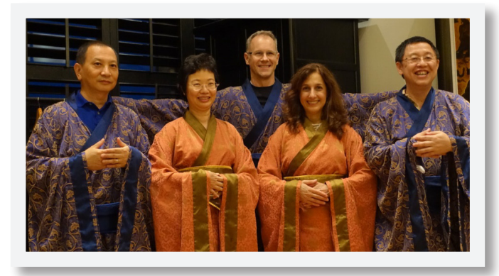
ASE volunteers dressed in attire to honor the host country's traditions.