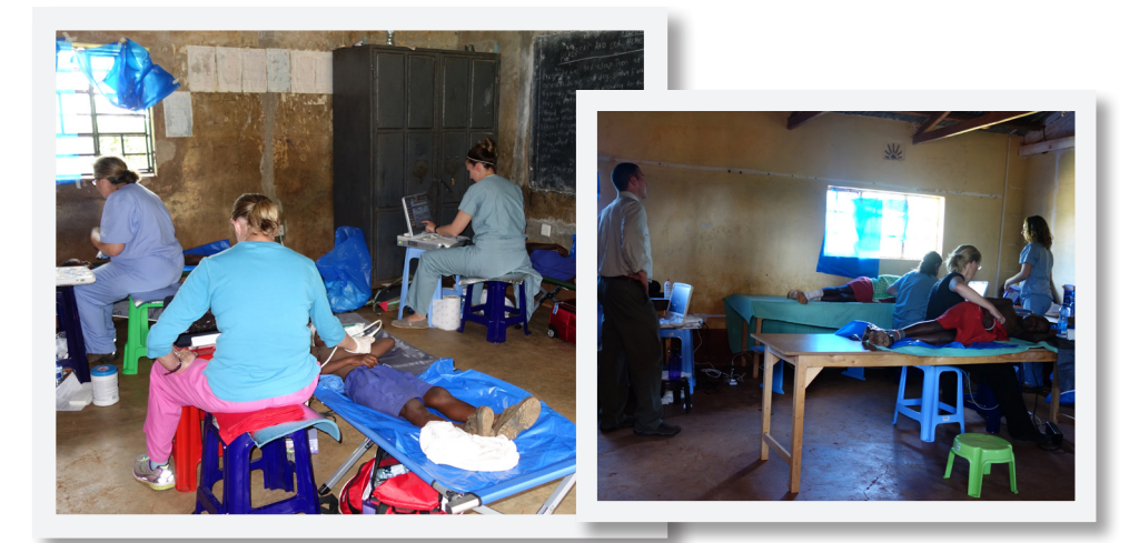
Classrooms were emptied to make room for our equipment. We brought all of the materials necessary for a makeshift echo lab – including camping cots and stools, patient gowns, tarps, and rolls upon rolls of paper towels – with us each day.