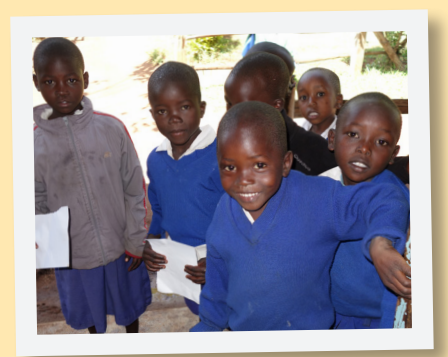
Little faces were constantly peeking around corners and through windows at each school, keeping an eye on what the visitors were doing.