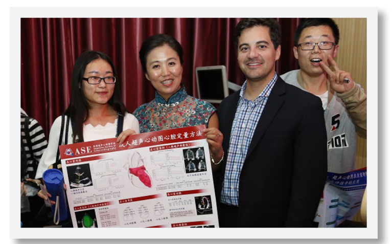
Distributing ASE posters following the lectures. Posters and USB drives, loaded with translated ASE guideline documents, were distributed to 600 attendees.