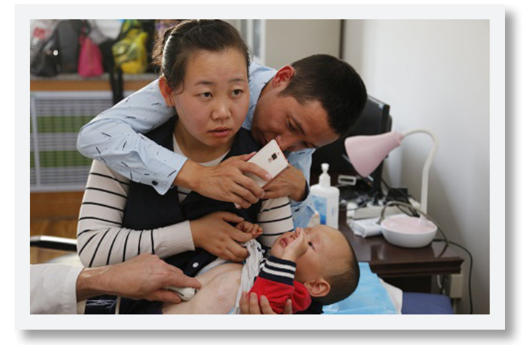
Phones were a favorite distraction for small children when cold probes were involved.