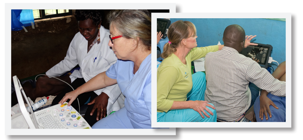
Learning from each other's professional experience is an important component of these events, and our team took every opportunity to offer training to our Kenyan colleagues.