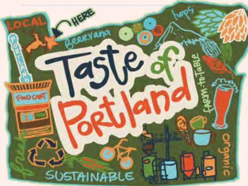
Leftbank Annex, 101 N Weidler Street Sunday, June 22, 7:00 pm to 12:00 am