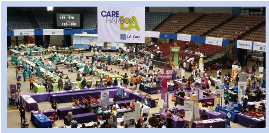
Seen from above, the floor of the LA Sports Arena is bustling with patients, physicians, nurses, technicians, and volunteers.