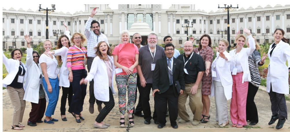
The ASE Foundation VALUES Program Volunteer Team jumps for joy after assessing and treating hundreds of patients with RHD!