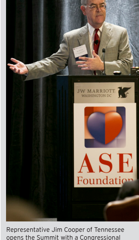
opens the Summit with a Congressional perspective on value-based healthcare.