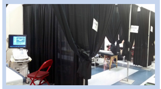
The ASE Foundation's designated echo area.