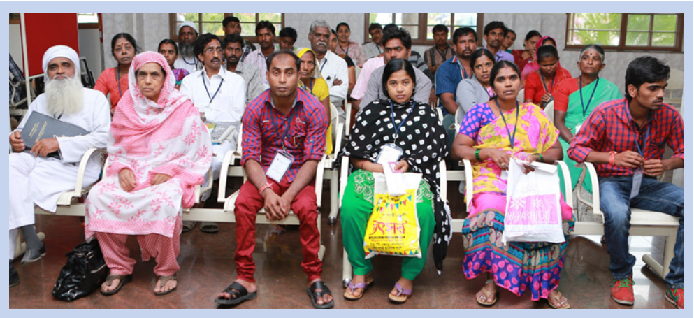
Patients of all ages afflicted by RHD are seen waiting for an evaluation.