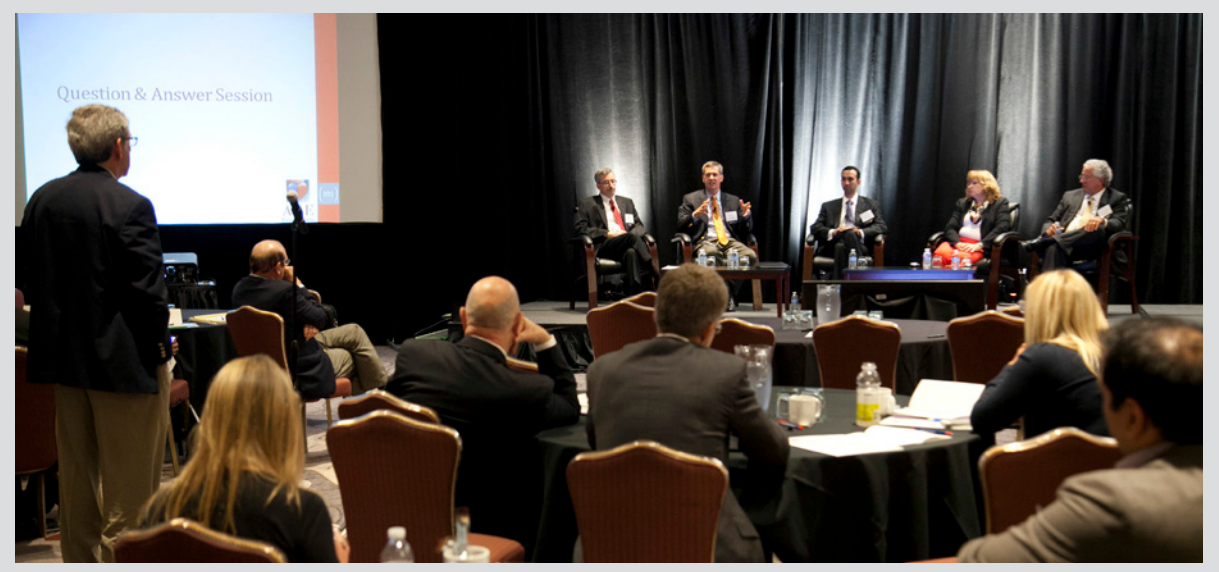
The Summit's question and answer session invited participants to interact with the payer panel.