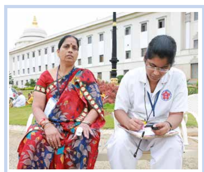
A patient and SSSIHMS cardiology professional utilize mHealth assessments

I think the ASEF visit has provided "role models" to the Indian sonographers, and suggested what is possible with hardwork, passion, but most importantly, a desire to empower. That inspiration will go a long way.