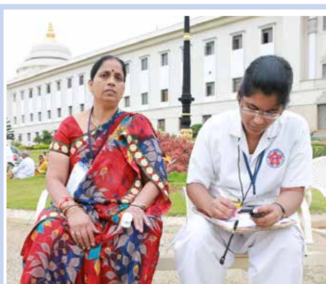
A patient and SSSIHMS cardiology professional utilize mHealth assessments

I think the ASEF visit has provided "role models" to the Indian sonographers, and suggested what is possible with hardwork, passion, but most importantly, a desire to empower. That inspiration will go a long way.