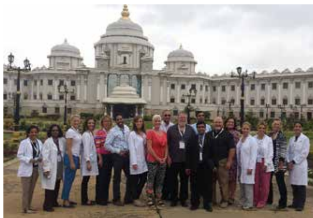
The 2014 ASEF VALUES Program Volunteer Team

Regular talks by the ASE faculty enhanced our understanding of the utility of contemporary echocardiographic modalities, and daily scanning and image interpretation sessions provided opportunities for one-on-one interaction. Local physicians gained immensely, and our sonographer and nursing students suddenly had "heroes" to look up to. I think the visiting team has touched far more lives than