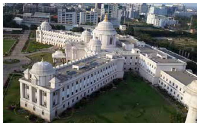
A view of the SSSIHMS from above

This opportunity, not often available to India, promised to improve our combined understanding of one of the oldest forms of heart disease known to man.